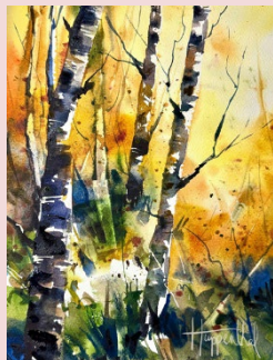
2 nd Jim Huppenthal