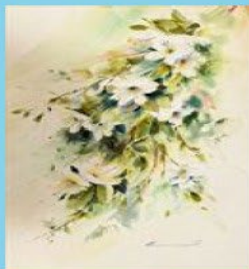
Fateme Kian "White Dream"