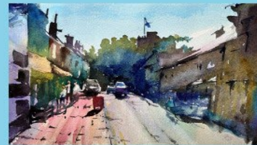
Meggie Chen "2nd Street"