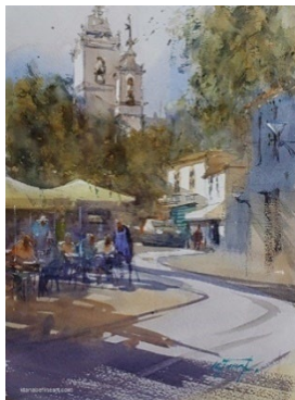
Keiko Tanabe January 2025