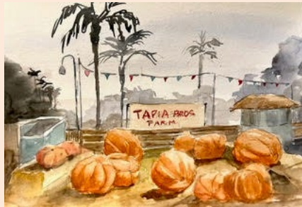
Watercolor sketch by Cris Gordy Tapia Bros. Farm, Encino. October 2024 Plein Air