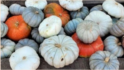
California Art Club - Los Angeles Chapter facebook.com