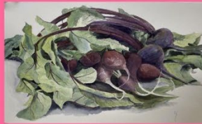
Liz Blum "Fresh From the Garden"