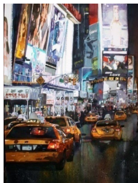
Laurie Goldstein-Warren October 2024