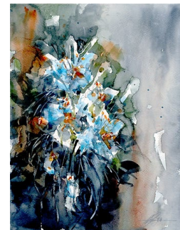
Moh'd Bilbeisi June 2025

Laurie Goldstein-Warren – Online Sat Oct 19 – Sun Oct 20, 2024, 9am - 1pm, 2-Days on ZOOM, [Register] $120 for VWS members, $160 for non-members