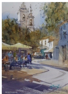
Keiko Tanabe January 2025