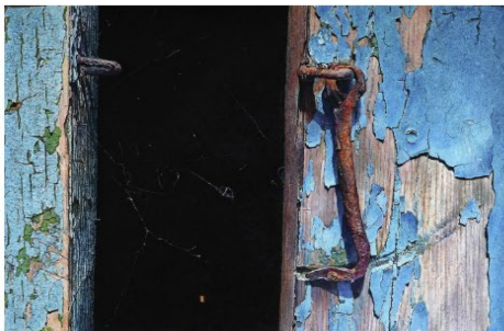
Angus McEwan, NWS "The Chasm"

2023 NWS 103rd International Open Exhibition