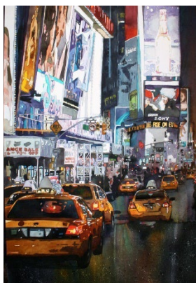
Laurie Goldstein-Warren October 2024