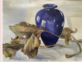
Honorable Mention Liz Blum