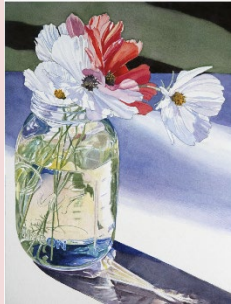
3 rd Place Debra Reynolds