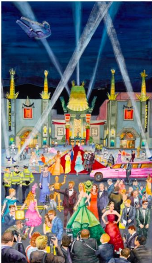
THE STARS COME OUT – GRAUMAN'S CHINESE THEATER, by GAYLE GARNER ROSKI

BOWERS MUSEUM, 2002 NORTH MAIN STREET, SANTA ANA, CALIFORNIA, 92706