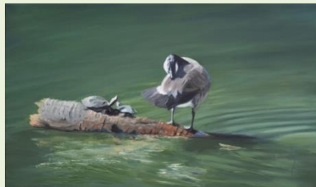
"The Goose Rests", oil, by Liz Blum

View the show at www.Onlinejuriedshows.com