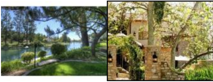
Top Row: Orcutt Ranch Bottom Row: Westlake Village Inn

Share Your Paintings on Facebook. It's easy to do! Post your paintings on Facebook—it's a great way to share your art and connect with other members at VWS. We love to see what our members are working on and encourage everyone to use FB as a venue to show your paintings. Tell us about your latest creation and inspiration! Give it a try and let us hear from you. We all may learn something from each other!