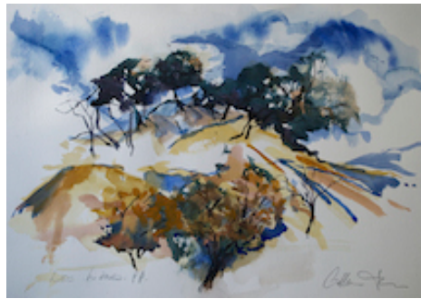
September Demonstrator Catherine Turr