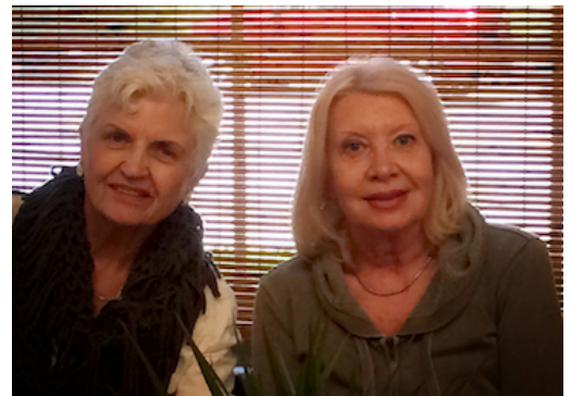
New VWS Board meeting and appreciation luncheon.