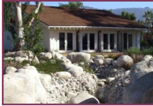
Reyes Adobe Museum

Wednesday Plein Air Group: Reyes Adobe Museum. Location: Reyes Adobe Historical Site 30400 Rainbow Crest Drive Agoura Hills, CA 91301 Take 101 Fwy to Reyes Adobe Road Go north to Rainbow Crest. Go left into Reyes Adobe Park. Click for website info