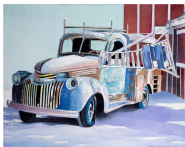
Debra Reynolds SECOND PLACE

CONGRATULATIONS TO OUR APRIL 8 TH SOCIETY SHOW WINNERS SELECTED BY FATEMEH KIAN!