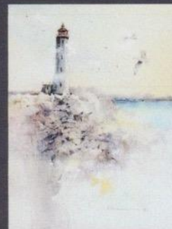
Fatemeh Kian "Stay Strong" 2020 Third Place