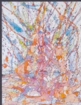
Peter McDonald "Turning Point" 2020 First Place