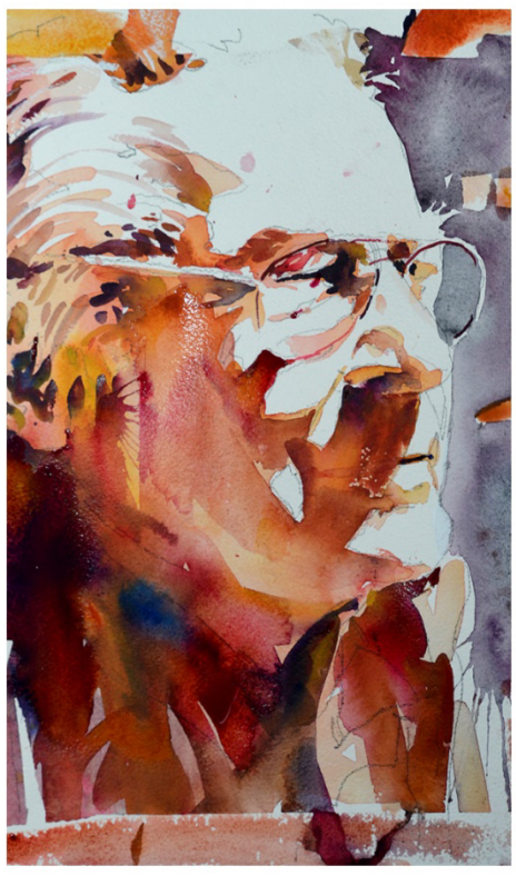
And held a 3-day workshop for members: