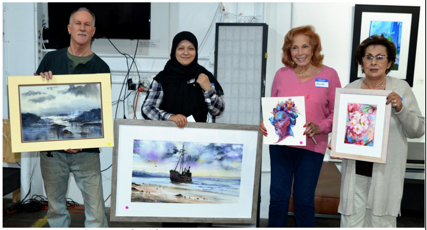
Congrats to our November winners, from left to right:

The Society Show is an opportunity for all members to show a painting at the General Meeting. Our guest artist selects four winners plus the plein air winner if there are plein air entries.