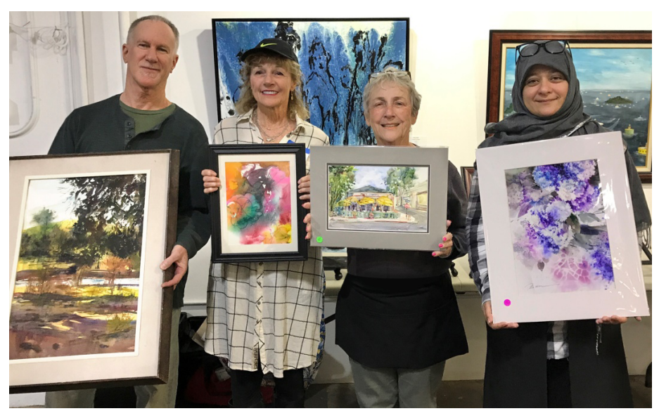
Congrats to our October winners, from left to right:

The Society Show is an opportunity for all members to show a painting at the General Meeting. Our guest artist selects four winners plus the plein air winner if there are plein air entries.