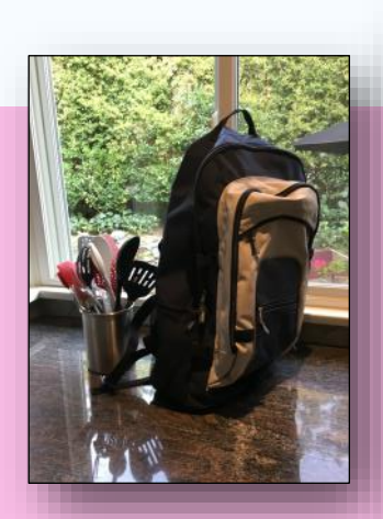
Large backpack, 24" long

FOR SALE: Jullian half box French plein air easel - $80. I only used it once and Amazon sells it for $159. Call Mich Laski at 818.634.7501.