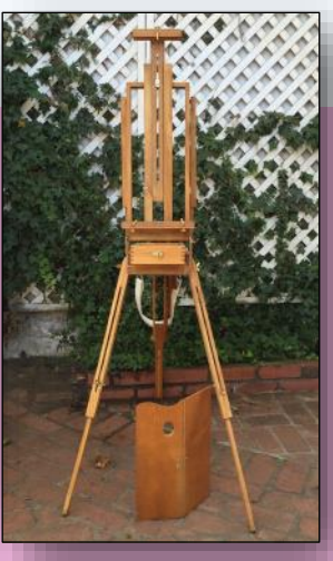
French plein air easel