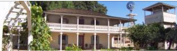
Leonis Adobe Museum

from the last parking area to the Culture Center. May 17th at Leonis Adobe Museum Directions: Take US-101 N to Valley Circle Blvd, Exit 29. Left onto Valley Circle. Use the 2nd from the right lane to turn right toward Calabasas Rd (signs for US-101 S/Los Angeles). Use the left lane to turn slightly right on to Calabasas Rd. Destination on right.