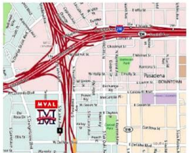
Maranatha High School, 169 South Saint John Avenue, Pasadena

From the north on the Foothill Freeway (210): Take the Colorado Blvd. exit, proceed straight onto Saint John Ave., and park in the underground parking structure on the right.