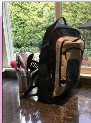
Large backpack, 24" long

FOR SALE: Jullian half box French plein air easel - $80. I only used it once and Amazon sells it for $159. Call Mich Laski at 818.634.7501.