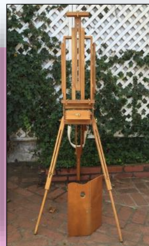
French plein air easel