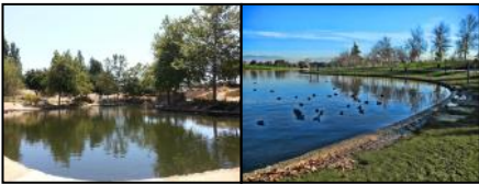
Top Left: Oak Canyon, Left: Lake Balboa

Saturday Group (third Saturday of the month): In January we'll be painting at beautiful Lake Balboa on Jan. 21, 2017. We will meet at 10 in the parking lot by the playground and go over to the area near the bridge as you drive in to paint the lake. Contact David Deyell for questions: (805) 494-1700 or email watercolorists@netzero.net