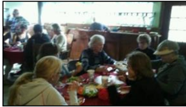
Lunch at the Duggan Ranch Gallery—November Paint-Out

The Thousand Oaks Art Association Open Show is coming up this February. This is an annual juried show at the spacious Community Gallery in Newbury Park (adjacent to Thousand Oaks). They are offering over $2,400 in awards, in six categories.